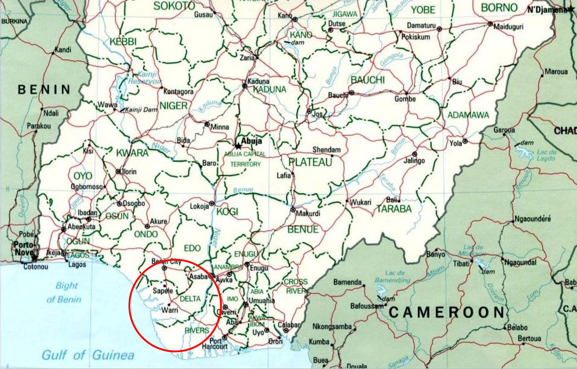
Delta State pilot study: Warri, Asaba and Abraka